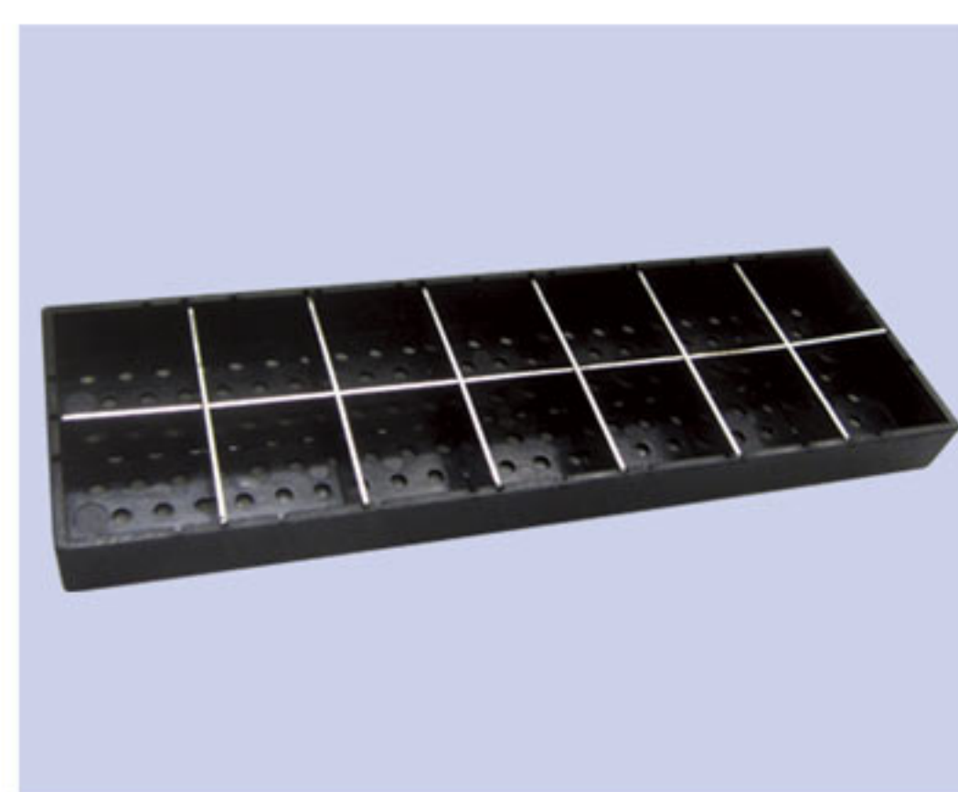
2X7 grid panel for large tissues