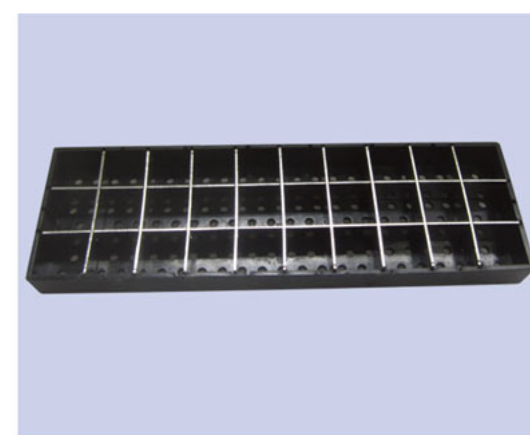
3X10 grid panel for small tissues